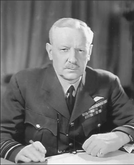
(above) After the Fire Storm