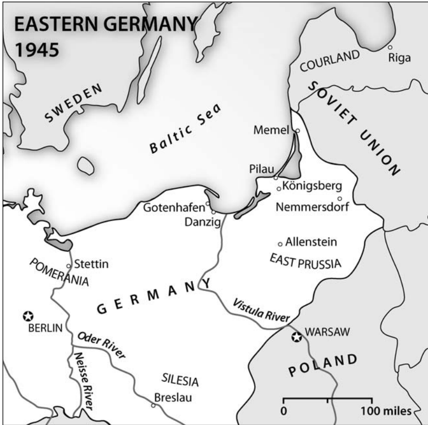
MAP BY JOAN PENNINGTON