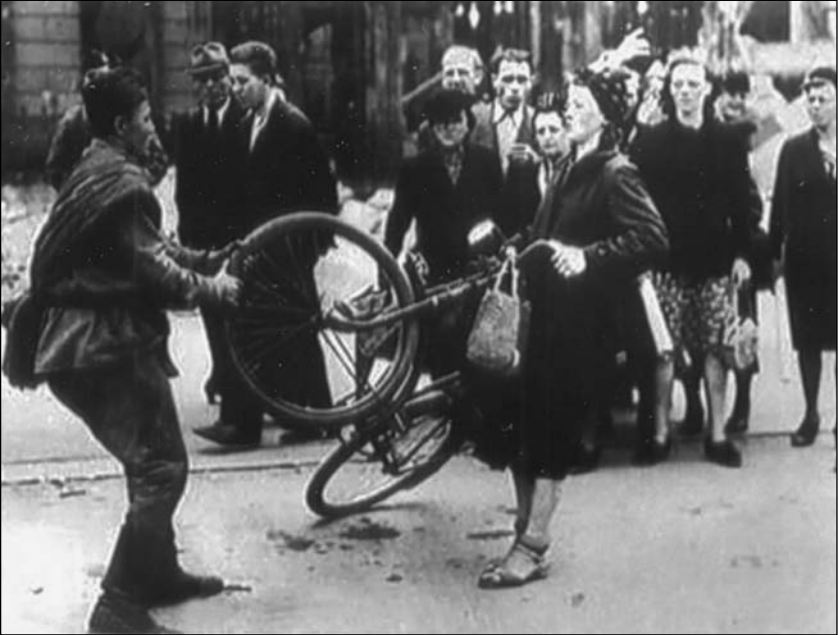
(above) The Spoils of War