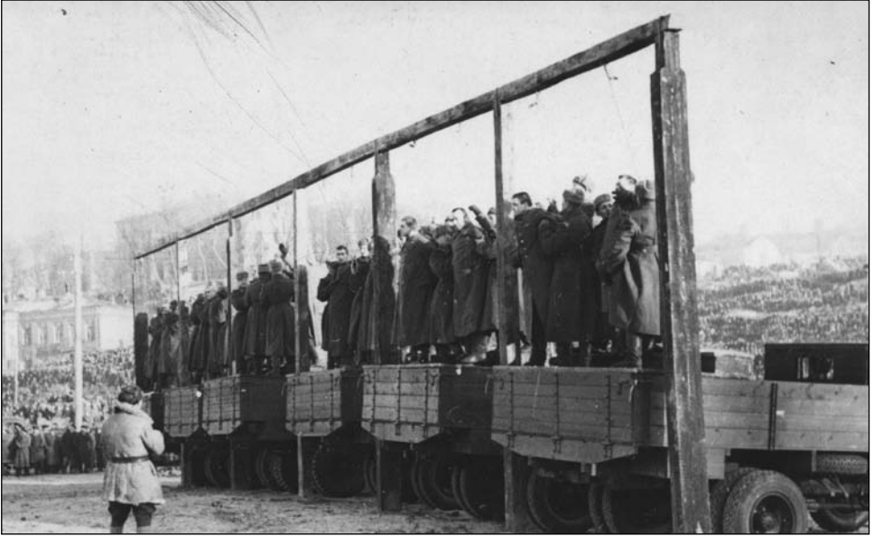
Public execution of Germans on Kreschatik. Kiev, 1946.