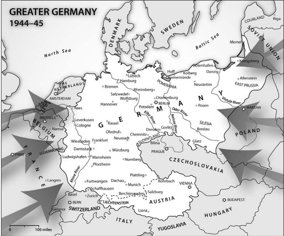
MAP BY JOAN PENNINGTON